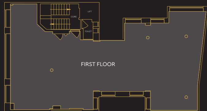
Indicative floor plans