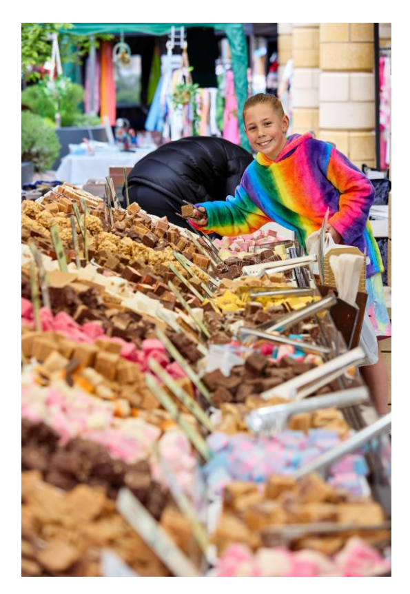
Through a series of successful social events at Lakeside Village in 2023, we have proudly raised £12,000 for the local community in Doncaster, which will help address pressing societal issues and support community initiatives.

Creating value for our communities in and around the assets we manage is something we strongly believe in, and which we constantly strive to find new ways of doing. As such, we will continue to work with communities where we operate, through engagement activities and initiatives that are aligned to local needs, or are within the context of wider societal issues.